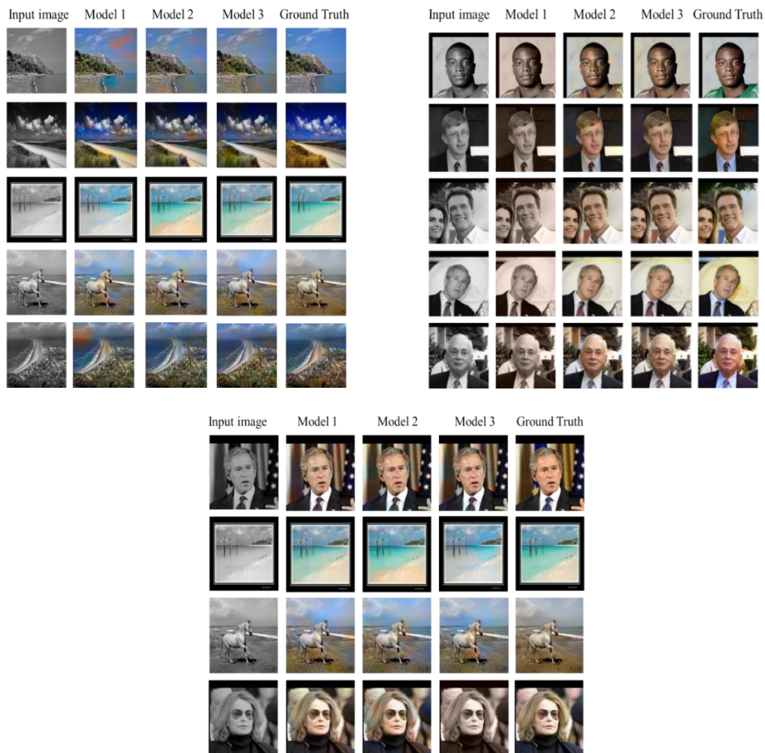
Figure 4. Comparison of the results with state-of-the-art models: top-left: ImageNet, top-right, and top-bottom: LFW.