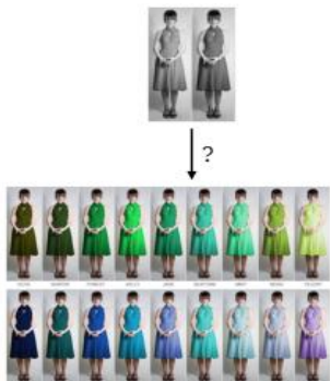
Figure 1. Possible different colors for an image.

The rest of this paper is organized as what follows. The related works are introduced in Section 2. The proposed model is described in detail in Section 3. The experimental results are provided in Section 4. Finally, we conclude the work in Section 5.